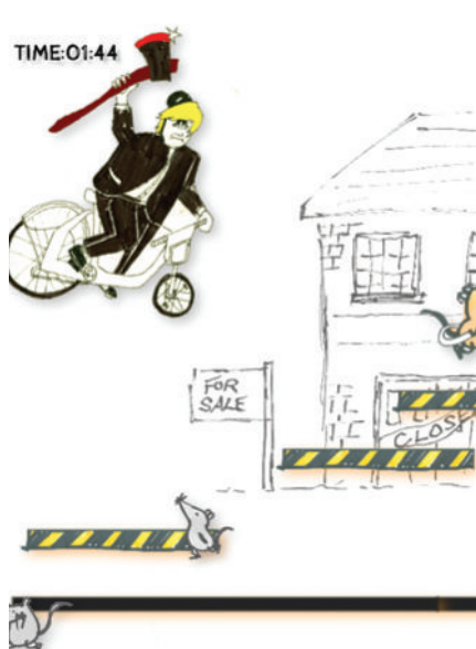
Game screens (clockwise): Play Southend - One Stan Army; from Play South Westminster - Grab the Cash; Dog Snog; It's on Fire, Oh No!