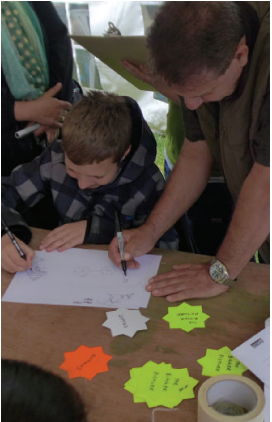
Play South Westminster at South West Fest Gala Day.