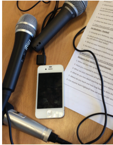
Digital Commonwealth participants on Orkney get to grips with using smart phones to produce a short interview with a local Kirkwall librarian, whilst being filmed for the Community Channel's Brilliant Scotland programme.